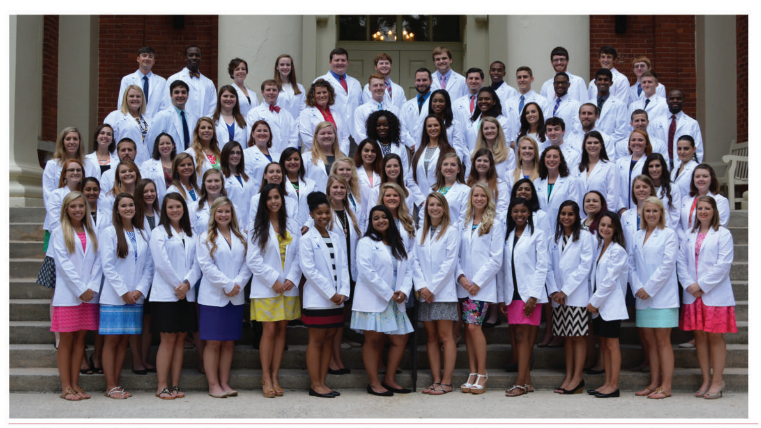
Care for the Community is not just something we say, it is the reason for everything we do.