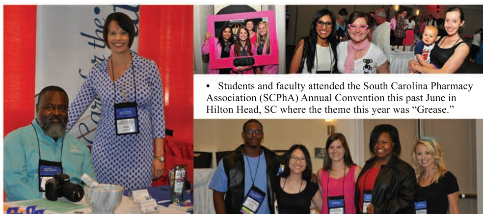
• Students and faculty attended the South Carolina Pharmacy Association (SCPhA) Annual Convention this past June in Hilton Head, SC where the theme this year was "Grease."