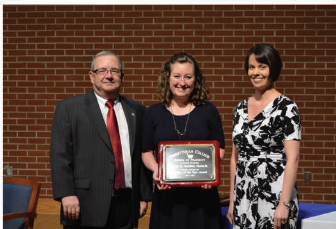
The 2015 Teacher of the Year Award: