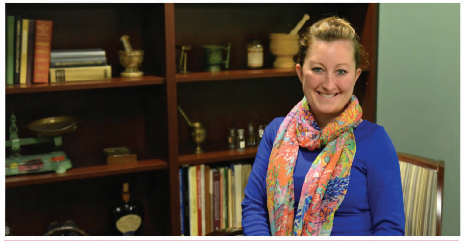
Care for the Community is not just something we say, it is the reason for everything we do.